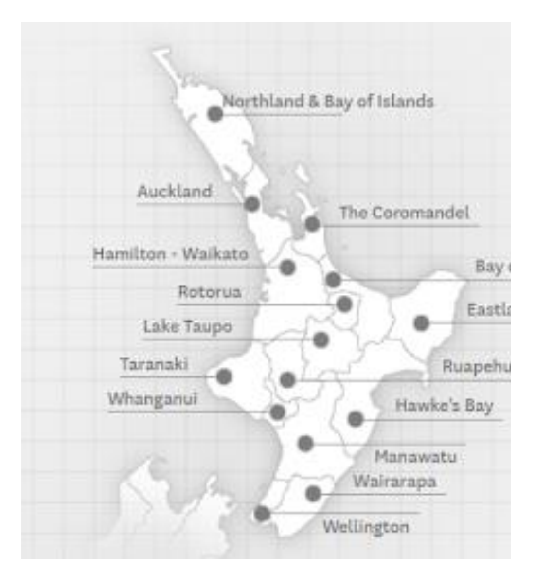
The fist part of the trip is on New Zealand's North Island