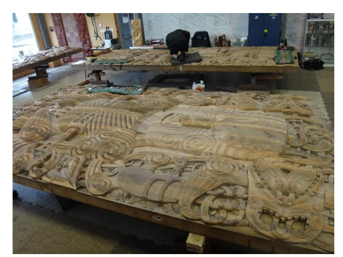
Day 4: Friday, Nov 3 – Historic Hongi's Track & Okere Falls walks, Bathhouse Museum visit